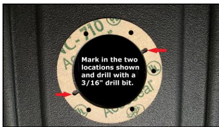
Figure 1: Gasket being used as template to mark drilling locations