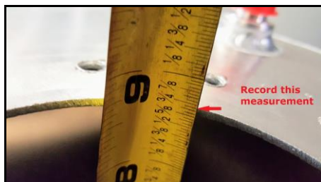
Figure 2: Measurement described in step 4.